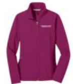
Port Authority Ladies Core Soft Shell Jacket Port Authority $35.00