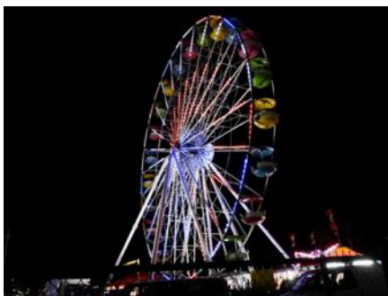
Carnival atmosphere at the track