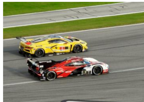
#3 Corvette and Overall race winning #7 Penske Porsche