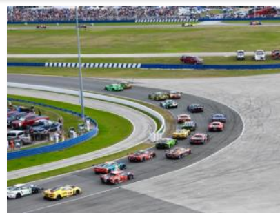
GTD cars race into Turn 1