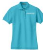
Ladies Pique Knit Polo Port Authority $19.00