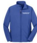
Core Soft Shell Jacket Port Authority $35.00