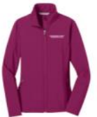
Port Authority Ladies Core Soft Shell Jacket Port Authority $35.00