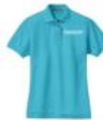
Ladies Pique Knit Polo Port Authority $19.00