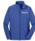
Core Soft Shell Jacket Port Authority $35.00