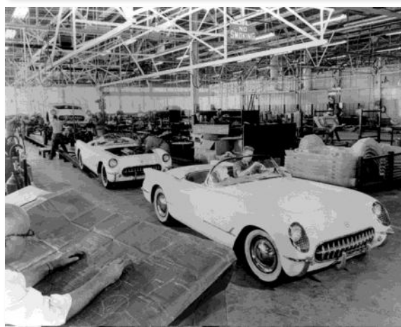
1953 Corvette Assembly in Flint Michigan