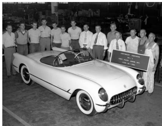
The first Corvette with the team in Flint, MI.