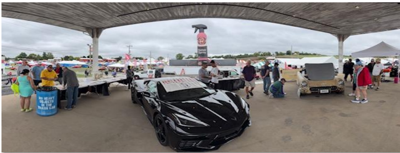
The 2025 Corvette Stingray Coupe raffle car on stage with the 1953 VIN001 Corvette.